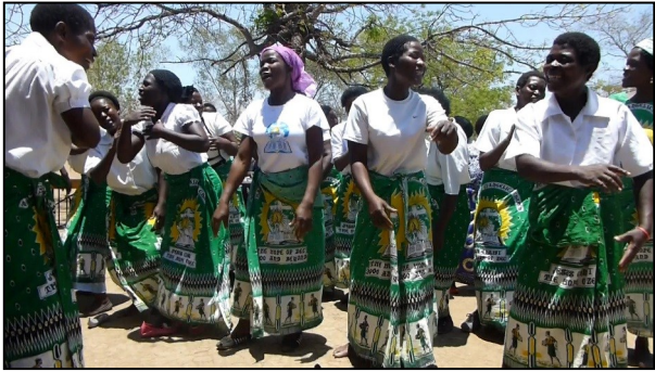
A Chiyanjano choir at Manjawira ZEC in central Malawi, wearing a current design of ZEC chitenje cloth.