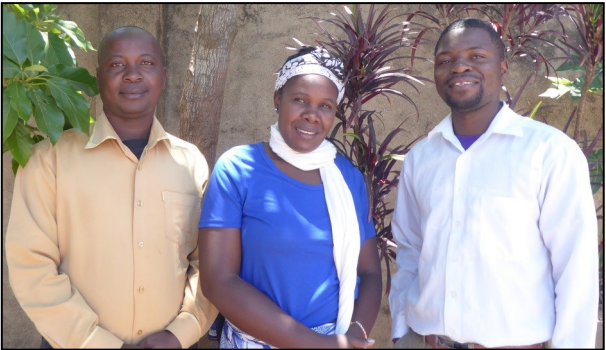
The CFCM team has been working hard throughout 2020 to promote the safety of children.