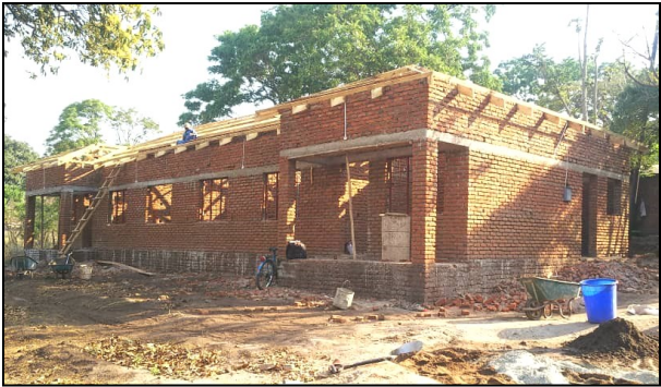
The partly constructed duplex house at EBCoM